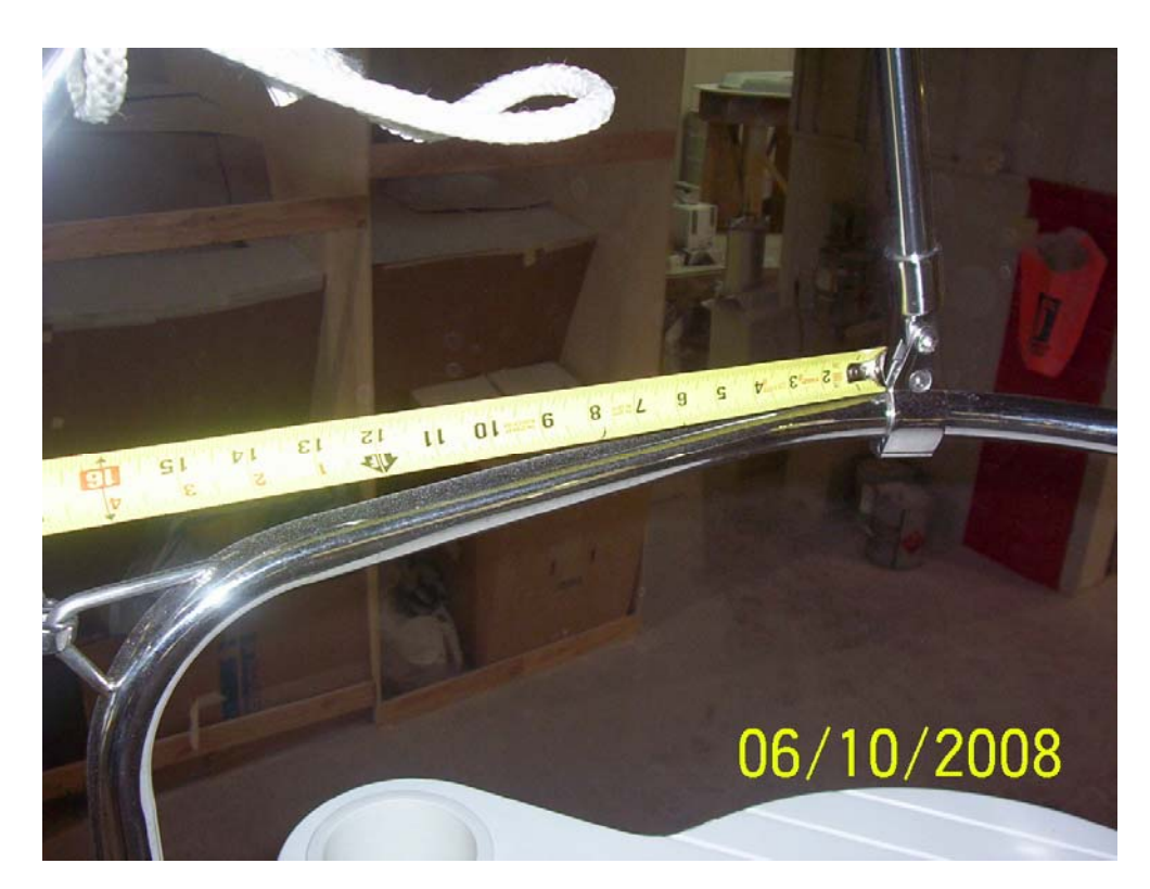
STIFF LEG MOUNTS 16"AFT OF STERNRAIL