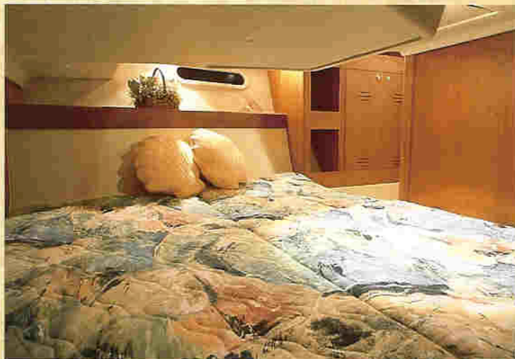
Headroom in the master stateroom is excellent. The queen-size berth is accompanied by two hanging lockers and plenty of stowage.

Going forward, you'll see serious non-skid and clear side decks due to the innovative rig arrangement. The B&R fractional rig with its swept-back spreaders eliminates the need for a backstay. Mast struts and reverse diagonals give all the strength needed while