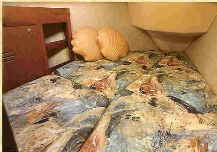
Forward, the guest stateroom is totally private and will hold all the gear your family or friends would need.

If you haven't sailed a Hunter lately, you really owe it to yourself to see what the latest innovations in building production boats can do for you.