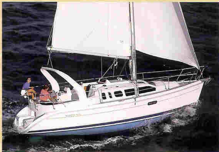
The 310 sports a long waterline giving her superb performance both on and off the wind. A low profile keeps her stable while the boom is high and out of the way.