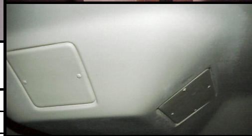
THE FOUR DIFFERENT TYPES AND SIZES OF ACCESS PANELS FOR LIGHTS GENERAL STEERING ARCH BOLTS