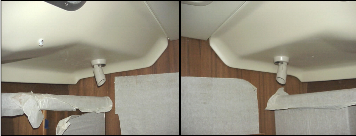
PORT READING LIGHT IN THE MAIN CABIN