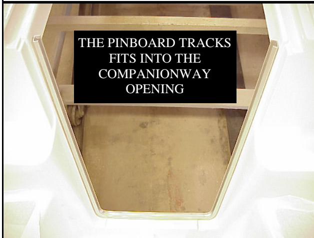
THE PINBOARD TRACKS FITS INTO THE COMPANIONWAY OPENING