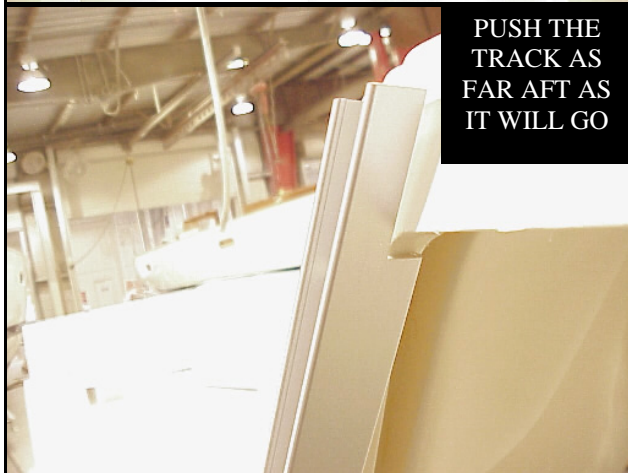
PUSH THE TRACK AS FAR AFT AS IT WILL GO