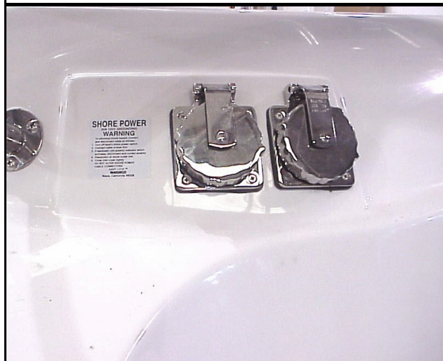
BOAT WITH STANDARD 110 VOLT OUTLET AND OPTION SECOND OUTLET (IF BOAT HAS AIR CONDITIONING AND/OR GENERATOR)