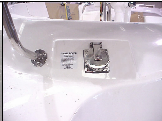
LOCATION OF SHORE POWER OUTLET AND OPTION SECOND OUTLET