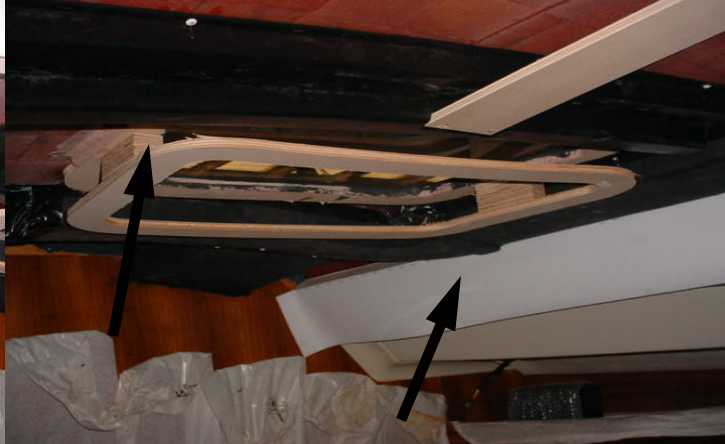
FIG 8. INSTALL WOODEN FRAME TO STBRD WINDSHIELD AND SHOWS THE WHISPER STRIP IS INSTALL TO STBRD SIDE