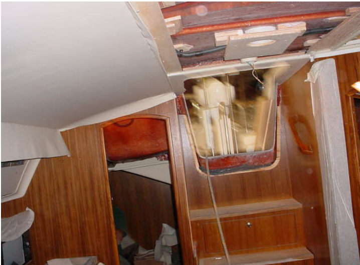
FIG 25. STBRD SIDE WHISPER IS TUCKED INTO WHISPER TRACK.