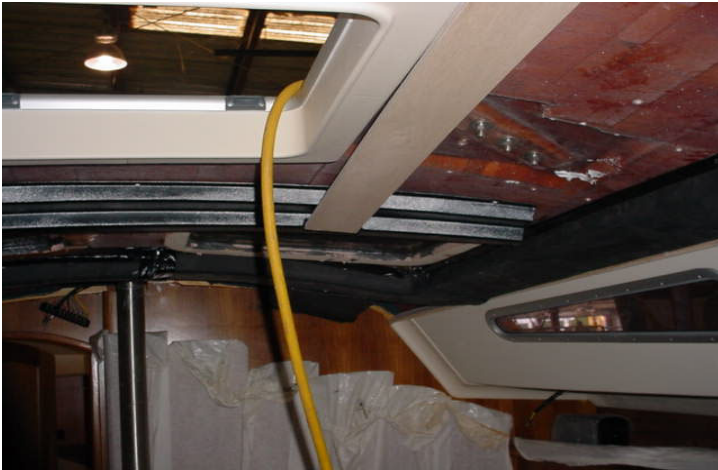
FIG 3. SHOWS THAT INSTALLATION OF ABS(PLASTIC) TO CEILING