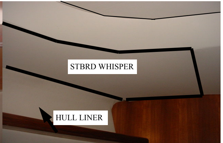
FIG 4. AFTER V-BERTH PORT SIDE WHISPER INSTALLATION