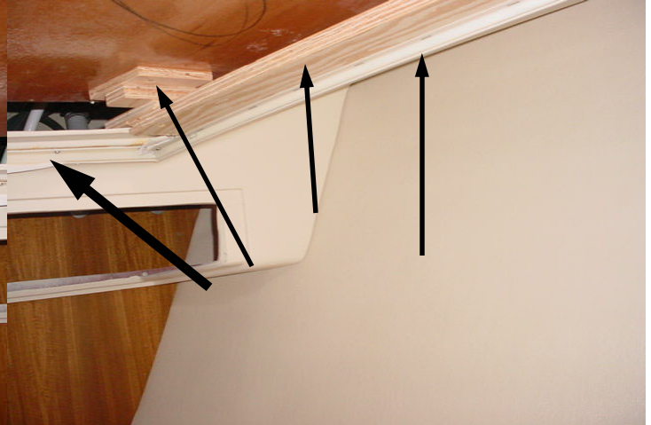
FIG 8. QUARTER BERTH STBRD SIDE FLOOR BOARD, SPCACER AND WHISPER TRACK . SPCACER BOARD IN-STALL REQUIRE ADHENSIVE TO CEILING