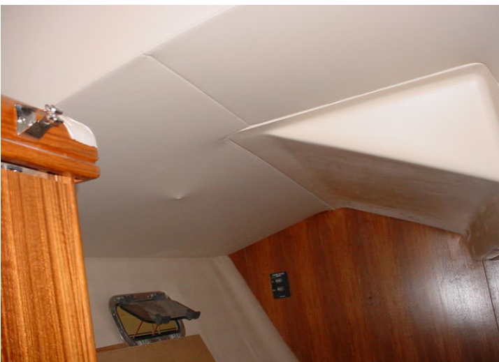
FIG 11. COMPLETE OF AFT STATE ROOM STBRD SIDE WHISPER