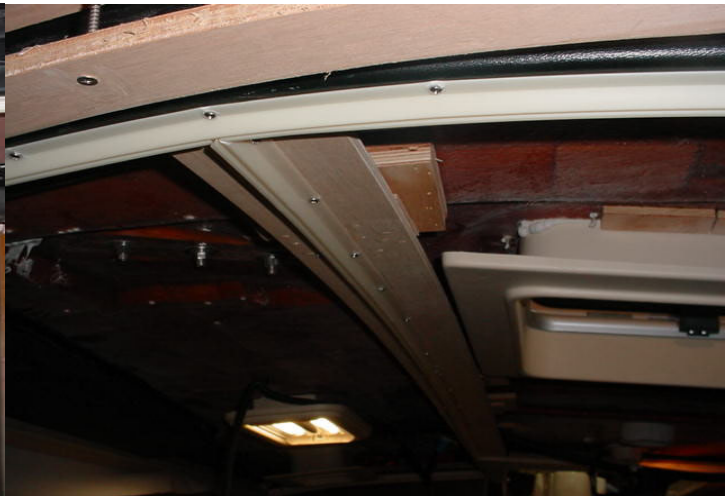
FIG 12. SHOWS THAT THER INTERSECTION OF THE TWO WHISPER TRACKS.