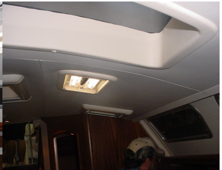
FIG 30. SHOWS COMPLETE INSTALLATION OF MAIN CABIN PORT SIDE WHISPER