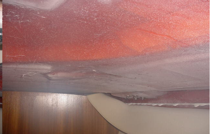
FIG 2. BEFORE V-BERTH STBRD SIDE WHISPER INSTALLATION