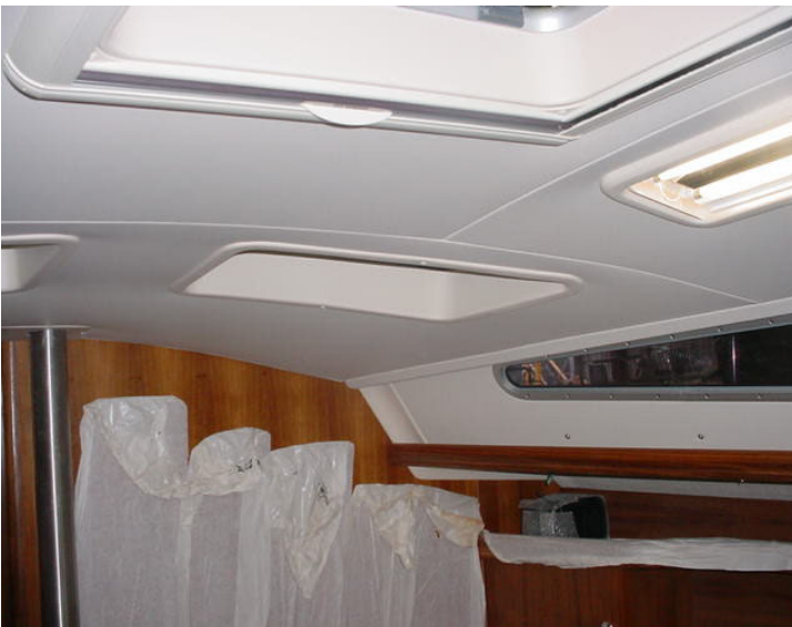
FIG 29. COMPLETE INSTALLATION OF MAIN CABIN STBRD SIDE WHISPER