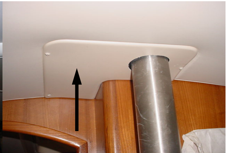
FIG 28. COMPLETE INSTALLATION OF THE MAST POST POLE WHISPER. ABS (PLASTIC) COVER