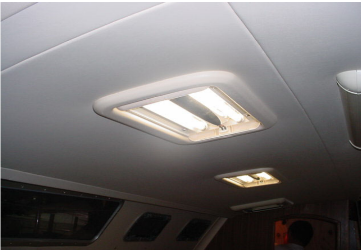
FIG 27. SHOWS COMPLETE INSTALLATION OF MAIN CABIN WHISPER AND CEILING LIGHT UNITS