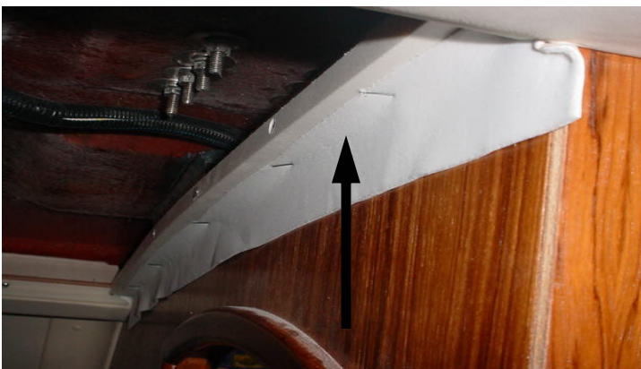
FIG 23. A CLOSE VIEW OF THE WHISPER STRIP THAT IS STAMPLED TO STARBOARD MATERIAL.