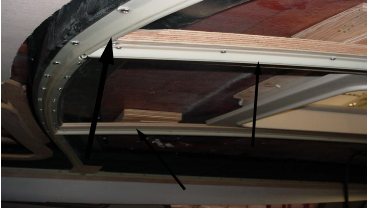
FIG 19. WHISPER TRACK ON PLASTIC(ABS) CROSSOVER GROUND AND BOTH CENTER WHISPER TRACK .