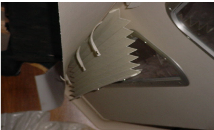
FIG 17. INSTALLATION OF STBRD SIDE BLIND BLIND WILL BE INSTALLED FOR EACH WINDOW OF STBRD AND PORT SIDE.