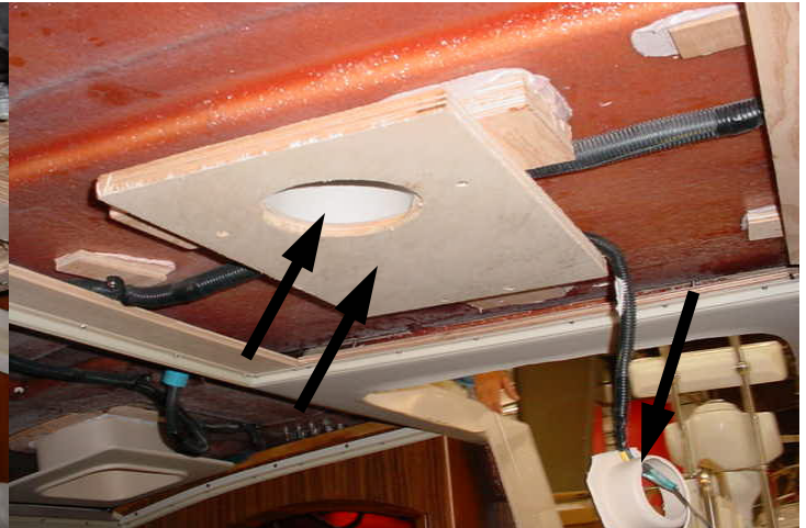
FIG 14. INSTALLATION OF DORATE VENT AND WHISPER GROUND AND ITS LIGHT BOX.