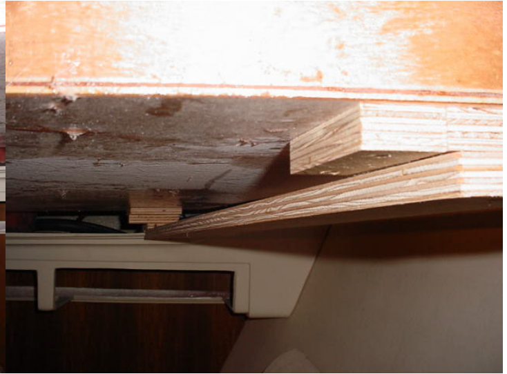
FIG 2. SHOWS INSTALLATION OF PORT SIDE FLOOR BOARD AND SPACER.