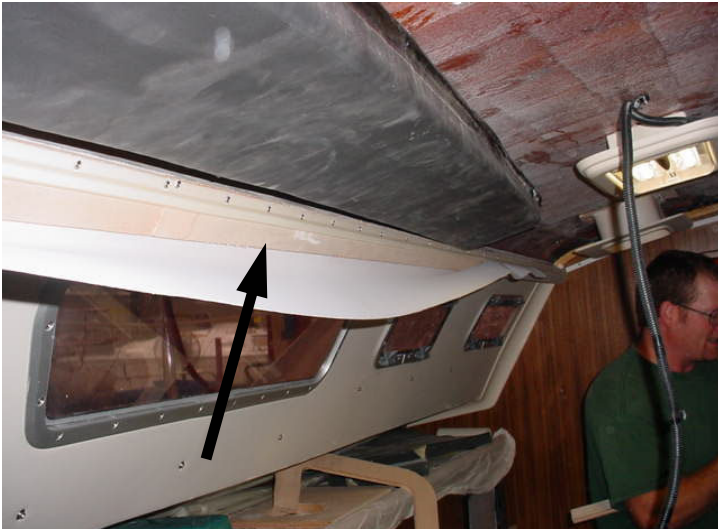
FIG 9. SHOWS THAT PORT SIDE INSTALLATION OF WHISPER STRIP , WHISPER GROUDS AND WHISPER TRACK