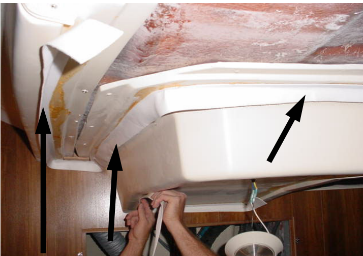
FIG 5. SHOWS INSTALLATION OF WHISPER STRIP ON PANEL