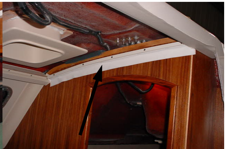
FIG 22. STAPLE WHISPER STRIP TO WHISPER HOLDER JUST ABOVE THE CABIN DOOR OF STBRD SIDE.