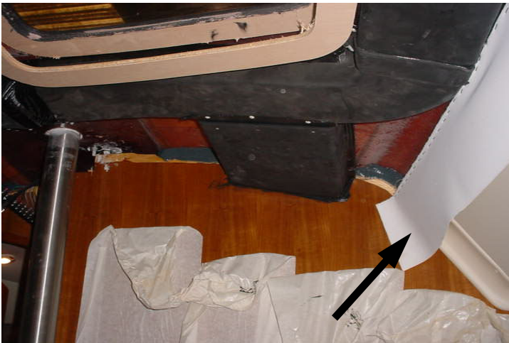
FIG 15. CLOSER LOOK OF THE STBRD SIDE WHISPER STRIP