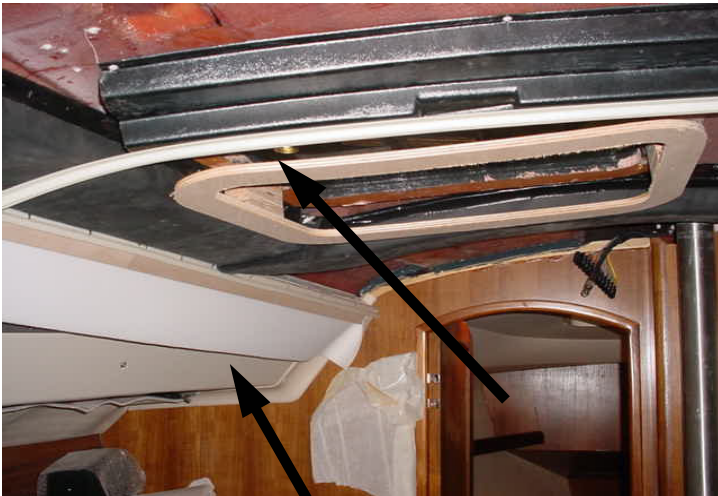
FIG 11. SHOWS THAT CROSS WHISPER TRACK IS INSTALLED AND PORT SIDE WHISPER STRIP IS INSTALLED