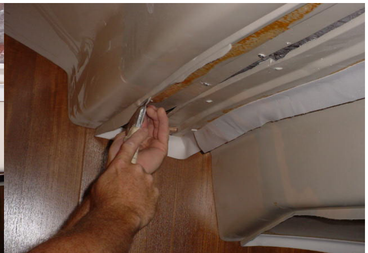
FIG 6. COMPLETE INSTALLATION OF WHISPER TRACK AND TUCK WHISPER STRIP INTO WHISPER TRACK.