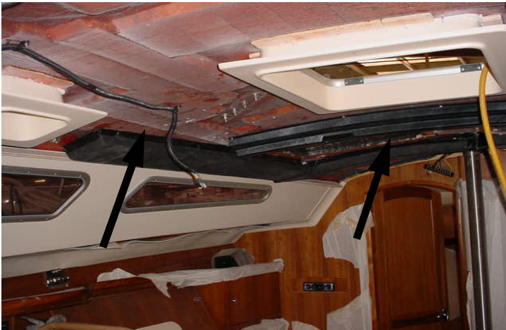
FIG 5. AIR DUCTS ARE INSTALLED TO PORT SIDE OF CEILING AND ATHARTSHIP (PORT TO STARBOARD)