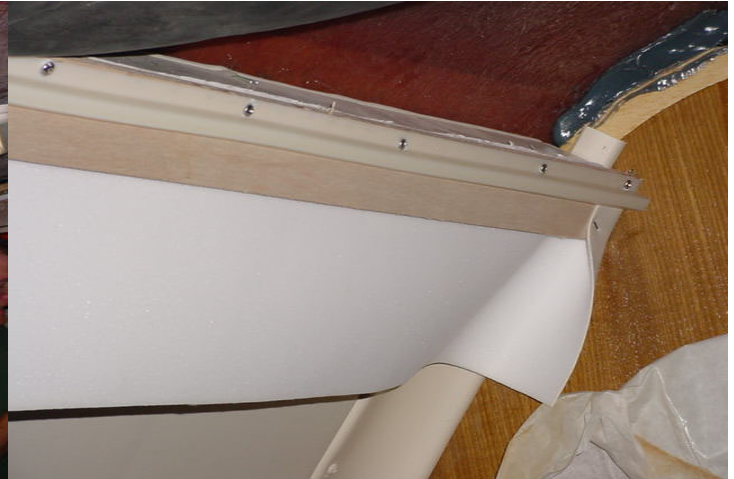
FIG 20. INSTALLATION OF WHISPER STRIP, WHISPER GROUND AT PORT SIDE UPPER INSTRUMENT PANEL. SAME PROCEDURE IS APPLIED TO STBRD SIDE.