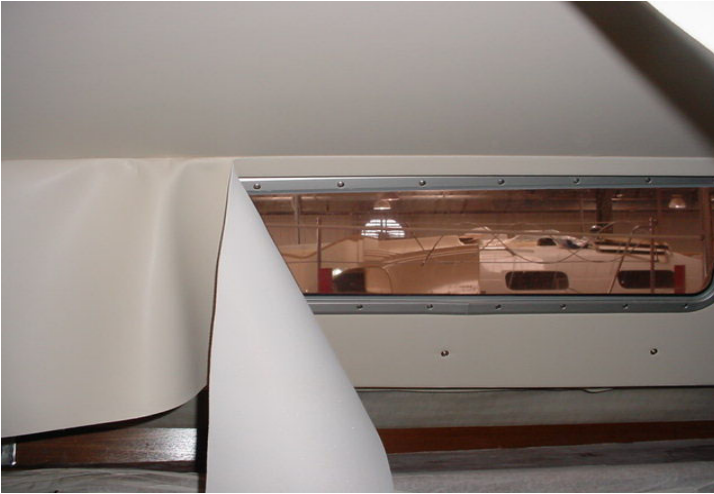
FIG 25. WHISPER IS CUT AND TRIMED TO COMPLETE