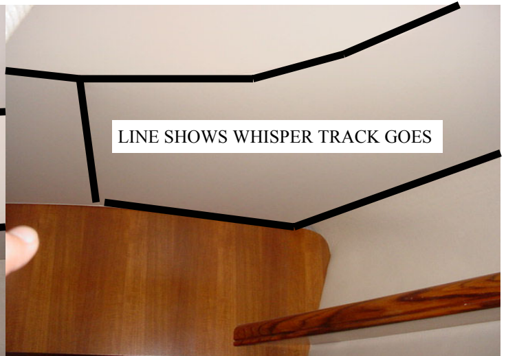
FIG 6. STBRD SIDE WHISPER DARK LINES SHOWS WHISPER TRACKS LOCATION