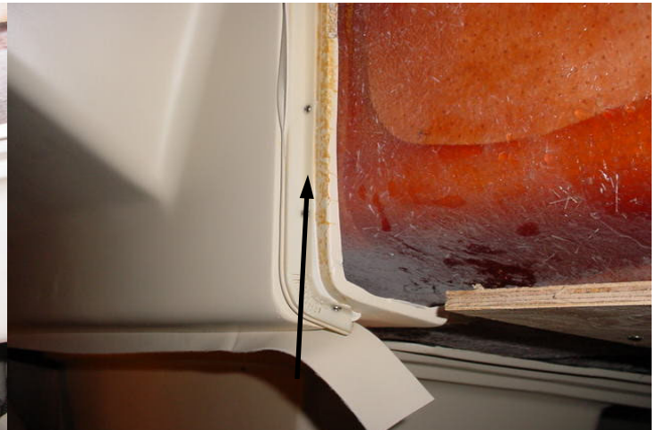
FIG 4. INASTALL WHISPER TRACK AND TUG WHISPER STRIP INTO WHISPER TRACK.