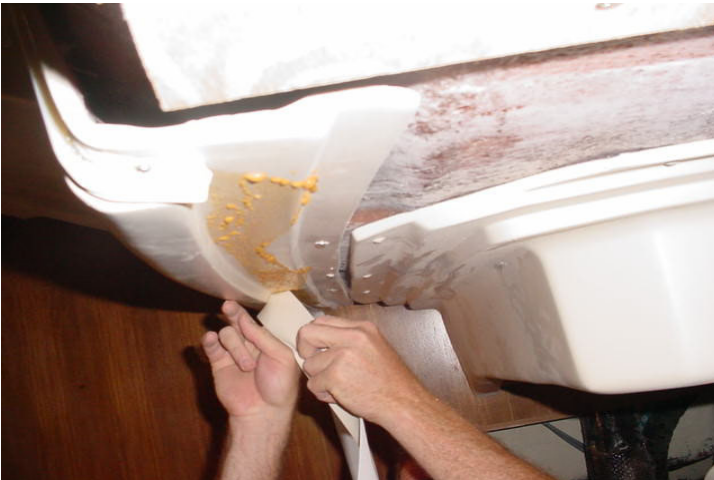
FIG 3. SPRAY ADHESIVE ON PANEL AND STICK WHISPER STRIP TO PANEL