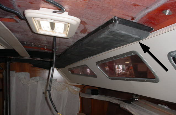
FIG 6. SHOWS COMPLETE INSTALLATION OF STBRD SIDE AIR DUCT