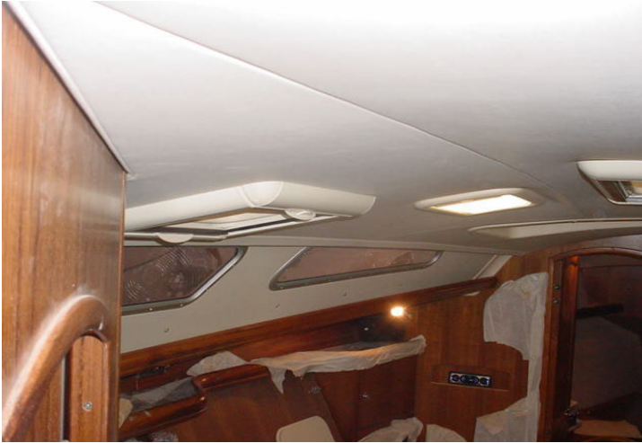
FIG 31. PORT SIDE MAIN CABIN WHISPER COMPLETE