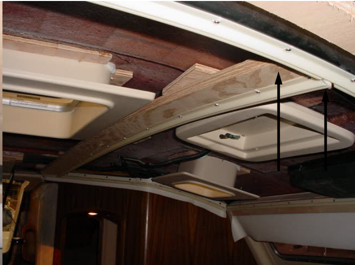
FIG 22. INTERSECTION OF CENTER WHISPER GROUND AND TRACK TO CROSSOVER PLASTIC WHISPER