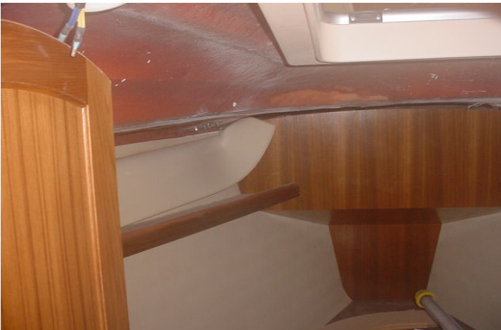
FIG 3. BEFORE V-BERTH SIDE PORT SIDE WHISPER INSTALLATION