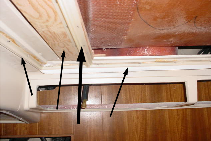
FIG 7. WHISPER GROUND AND WHISPER TRACK AT QUARTER BERTH STBRD SIDE