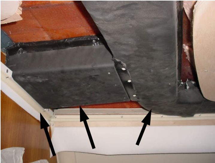
FIG 21. SHOWS WHISPER TRACKS AROUND FWD MAIN CABIN BULKHEAD AND AIR DUCT