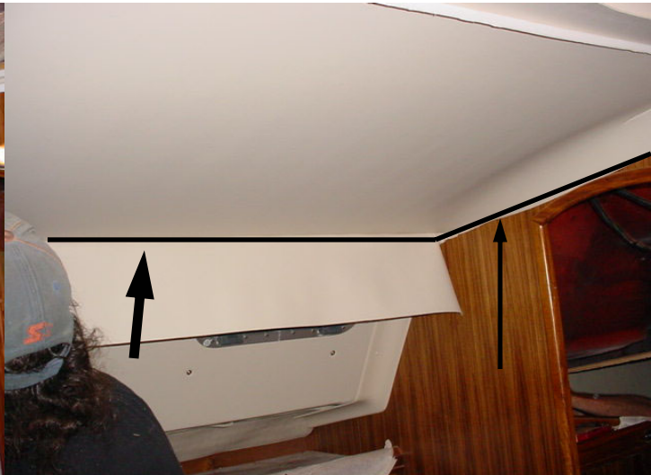
FIG 24. WHISPER IS TUCKED INTO WHISPER TRACK AT STBRD SIDE AND AFT CABIN BULKHEAD