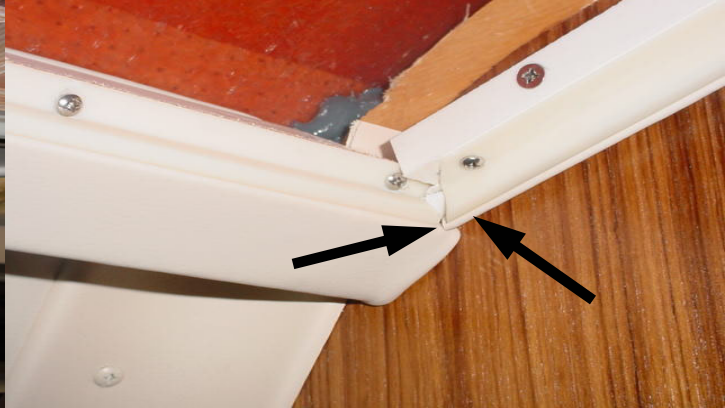
FIG 20. INTERSECTION OF TWO WHISPER TRACKS MUST BE WELL CUT AND MATCHED.