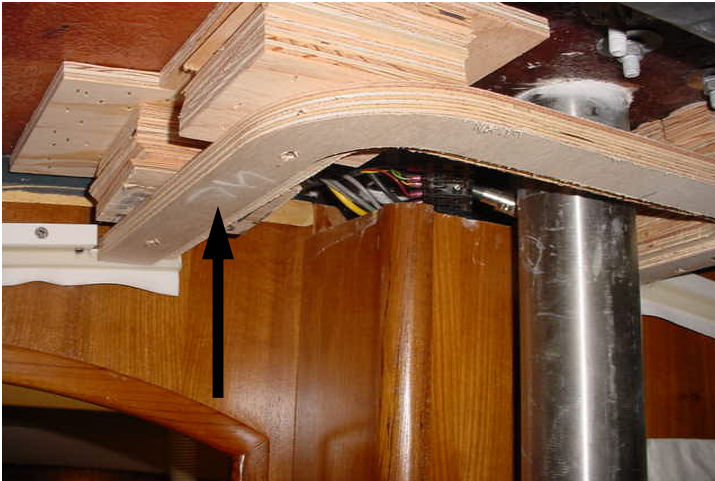
FIG 13. SHOWS THE INSTALLATION OF WHISPER GROUND AROUND FWD CABIN BULKHEAD AND MAST POST POLE.