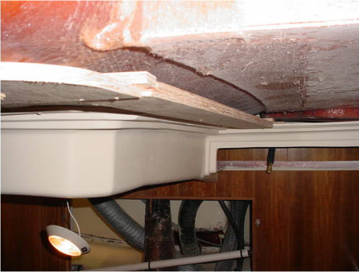
FIG 1. SHOWS INSTALLATION OF ABS PANEL AT AFT CABIN CEILING