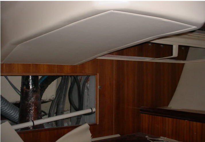
FIG 9. COMPLETION OF STEERING RADIANT PANEL WHISPER