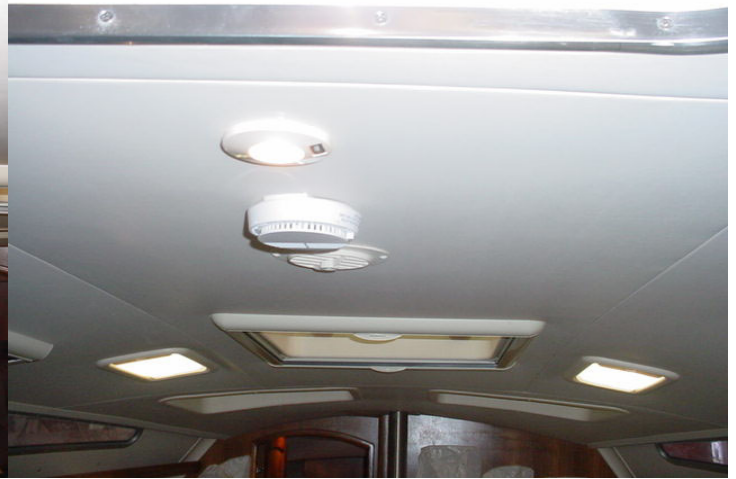
FIG 32. SPOT LIGHT, DORADE VENT AND SMOKE ALARM ARE INSTALLED AFTER WHISPER IS DONE.