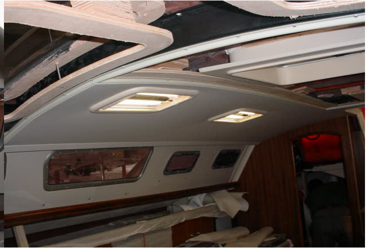
FIG 26. COMPLETION OF PARTIAL MAIN CABIN WHISPER WORK