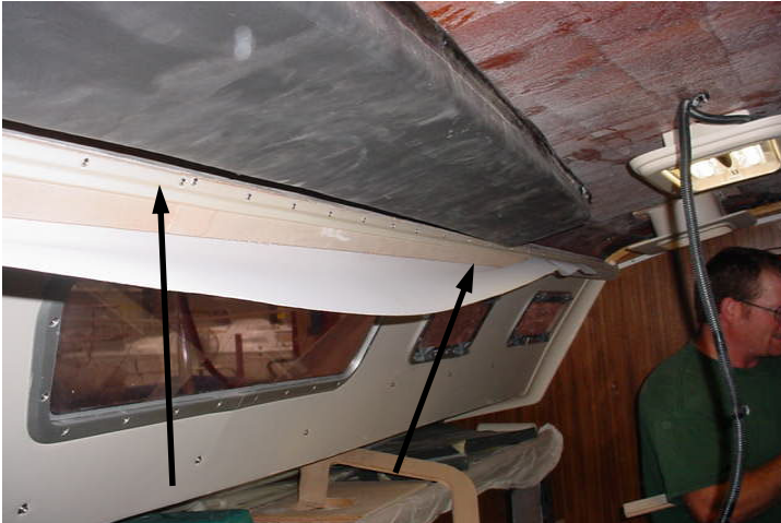
FIG 19. INSTALLATION OF STBRD SIDE WHISPER TRACK PROCEDURE IS APPLIED TO BOTH STBRD AND PORT SIDES