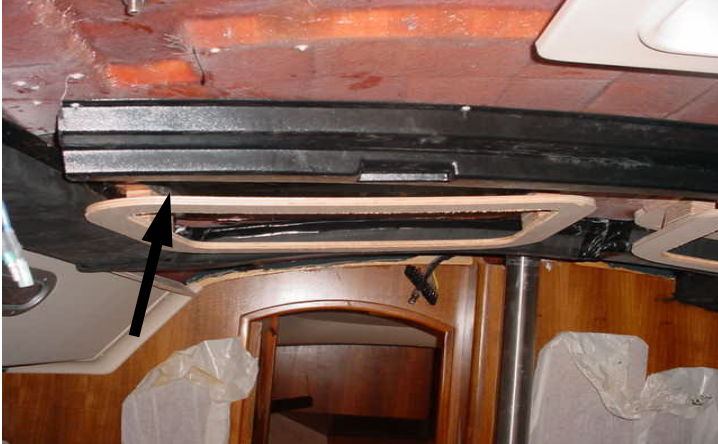
FIG 7. INSTALL POPRT SIDE WINDSHIELD WOODEN FRAME AND SPACER BOARDS .