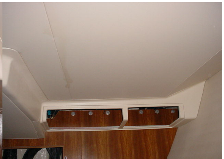
FIG 12. COMPLETE OF AFT STATE ROOM PORT SIDE WHISPER