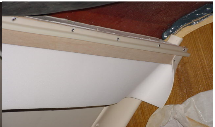
FIG 18. INSTALLATION OF WHISPER TRACK TO PORT SIDE AND ALONG THE TOP EDGE OF WHISPER GROUND