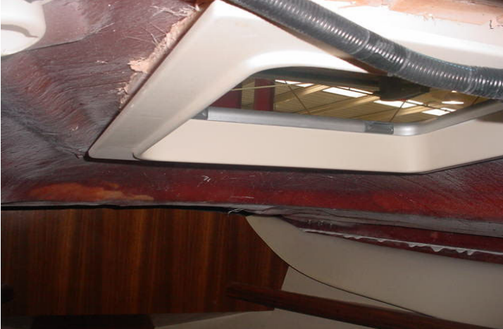
FIG 1. BEFORE V-BERTH WHISPER INSTALLATION