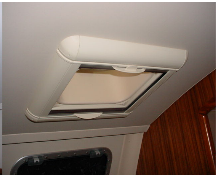
FIG 34. STBRD SIDE HATCH FRAME IS INSTALLED AFTER WHISPER IS DONE.