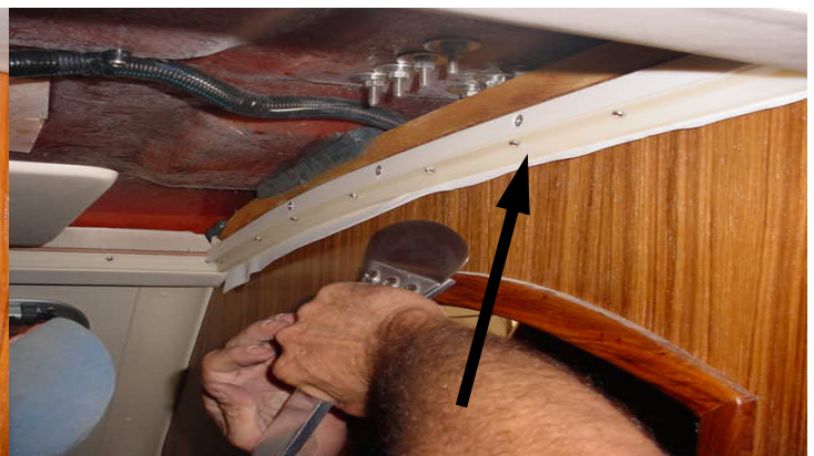
FIG 24. TUCK WHISPER STRIP INTO WHISPER TRACK AFTER WHISPER TRACK IS INSTALLED.