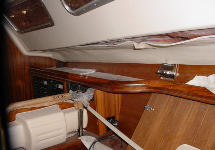
FIG 2. INSTALL HULL LINER TO PORT SIDE WOOD HULL PANEL. ADHESIVE IS APPLIED TO HOLD HULL LINER TO HULL INBOARD SURFACE.