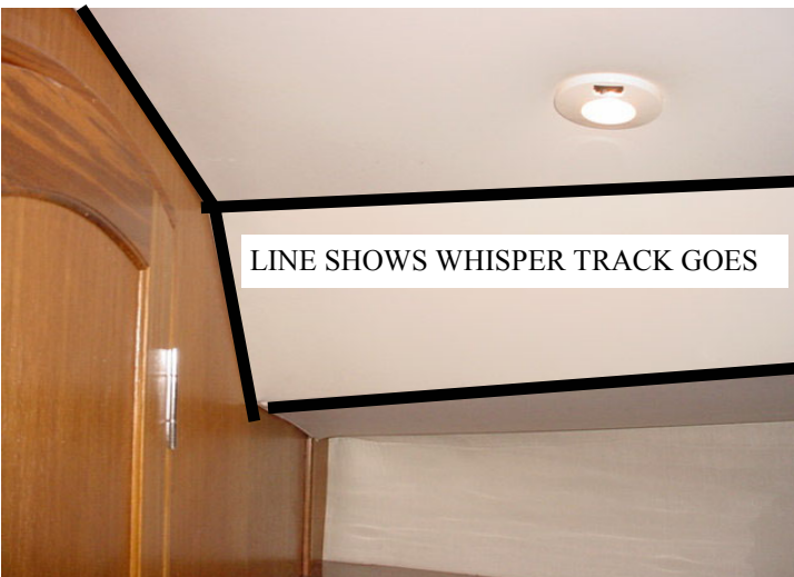
FIG 5. V-BERTH AFT BULKHEAD STBRD SIDE WHISPER