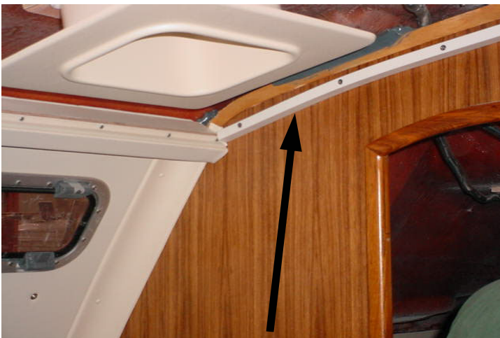
FIG 21. WHISPER GROUND IS INSTALLED TO MAIN CABIN AFT BULKHEAD