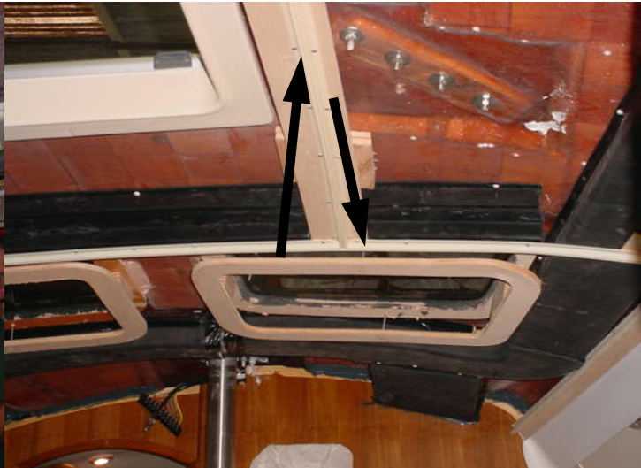
FIG 10. SHOWS THE COMPLETION OF STBRD CENTER WHISPER GROUND AND WHISPER TRACKS