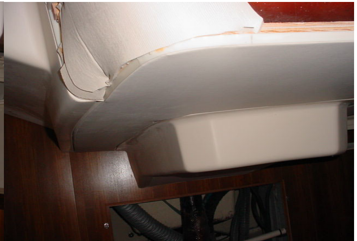
FIG 10. COMPLETION OF STEERING RADIANT WHISPER