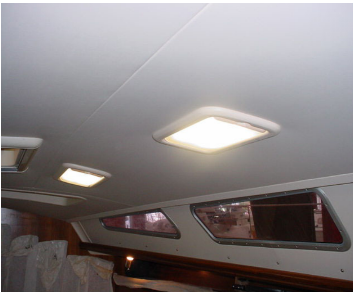
FIG 33. STBRD SIDE CEILING LIGHT UNITS ARE INSTALLED AFTER WHISPER IS DONE.