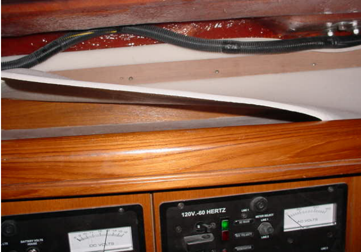
FIG 1. SHOWS THAT INSTALLATION OF WHISPER GROUNDS AND HULL LINER AT TOP OF WOOD HULL PANEL .SAME PROCEDURE SHOULD BE APPLIED TO STBRD SIDE.