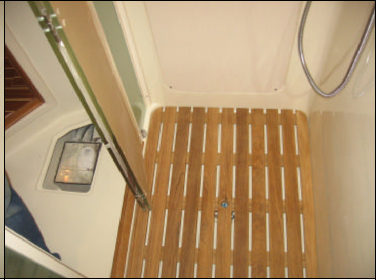
2. Close the plexi-door