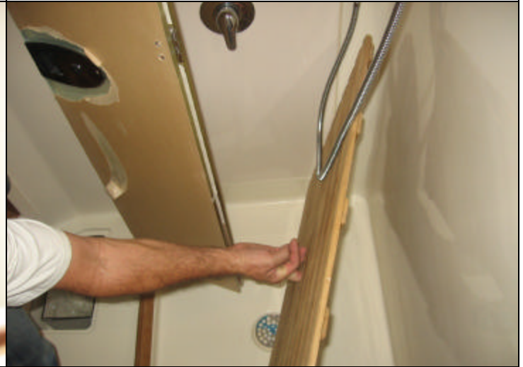
4. Swing and lift the floor grate ( Do not damage gel coat or parts during process)