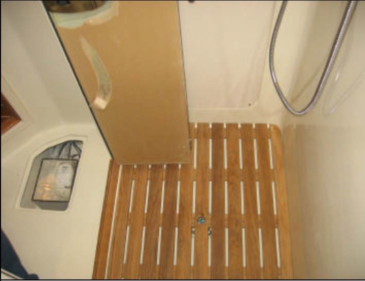
1. Fold the plexi-door