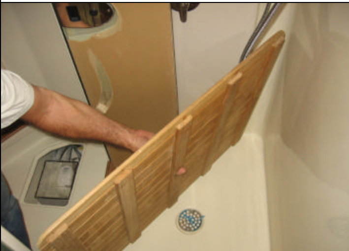
5. Turn the grate diagonal and toward the door