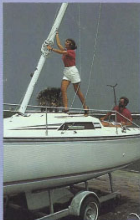
"Easy to Step"

Only Hunter Marine Can Offer You A New Hunter 23, Outboard Motor And Galvanized Trailer For One Low Affordable Price!