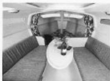
Sleeps four in comfort

Anchor Roller Bimini Top-Blue w/Aluminum Frame Camper Enclosure Cockpit Cushions-White Sunsure™ Companionway Canvas Compass Cruising Spinnaker Gear Fabric Interior Upgrade 4 HP Outboard Motor 8 HP Outboard Motor 9.9 HP Outboard Motor Roller Furling Jib Sail Cover Stern Rail Seats