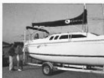
Easy trailering for family fun