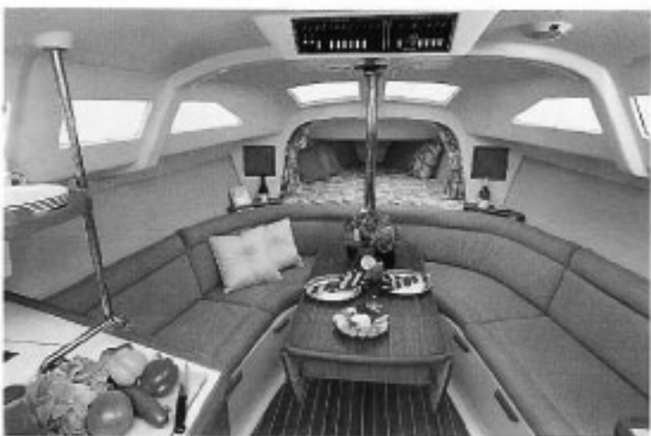
An unexpected pleasure is the flexible interior layout that sleeps six and is well suited for cruising or entertaining.