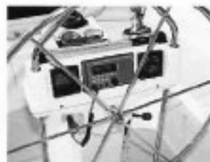
Wheel steering console with engine controls and lighted compass.