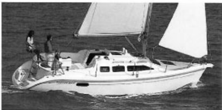
The 29.5 is a boat to be enjoyed by the entire family. Enjoy the spirit of competition, the pleasures of cruising, or both.