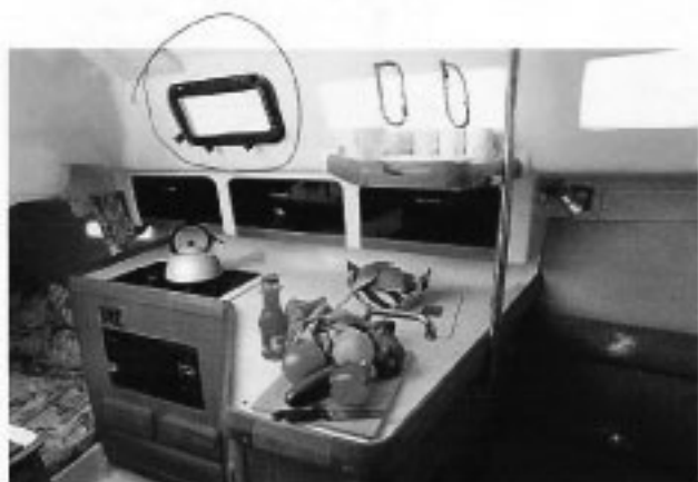
A major feature below deck is a bright, spacious galley, perfect to fix a snack or create a gourmet meal.