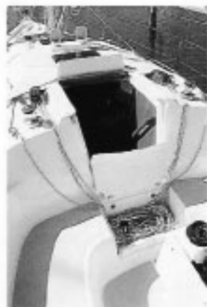
Dorade vents, triple rope clutch and line organizer.