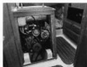
Auxiliary power is provided by a freshwater cooled, 18 HP Yanmar® diesel.

I = 34' 0" J = 10' 4" P = 36' 4" E = 12' 8"