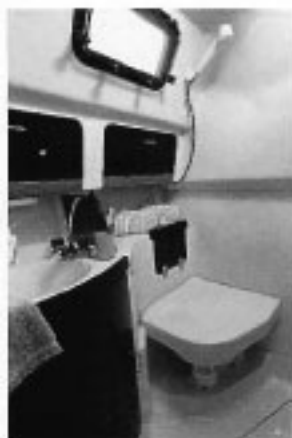
Private shower, marine head and vanity with mirror.