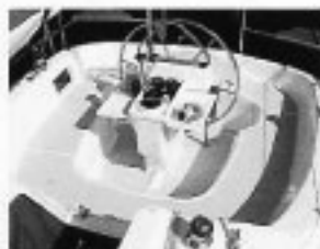
"Action Central" - Huge 7' by 7' modified T-shaped cockpit.