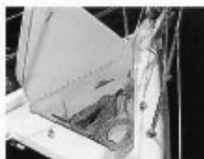
Cast aluminum anchor roller, bow pulpit and on-deck anchor well.