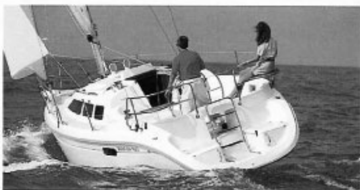
A walk-through transom, integrated swim platform, and a stern rail with seats is the view of the 29.5 most often seen by the competition.