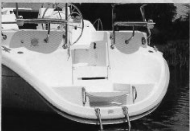
Hunter's trademark walk-through transom makes boarding safe and easy from the dock or from the water. A retractable swim ladder and optional transom shower make swimming and diving a pleasure.