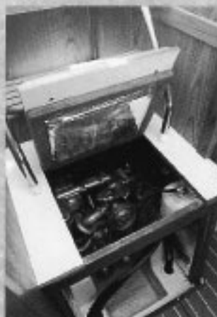
Engine access is excellent as panels are removable on all sides.