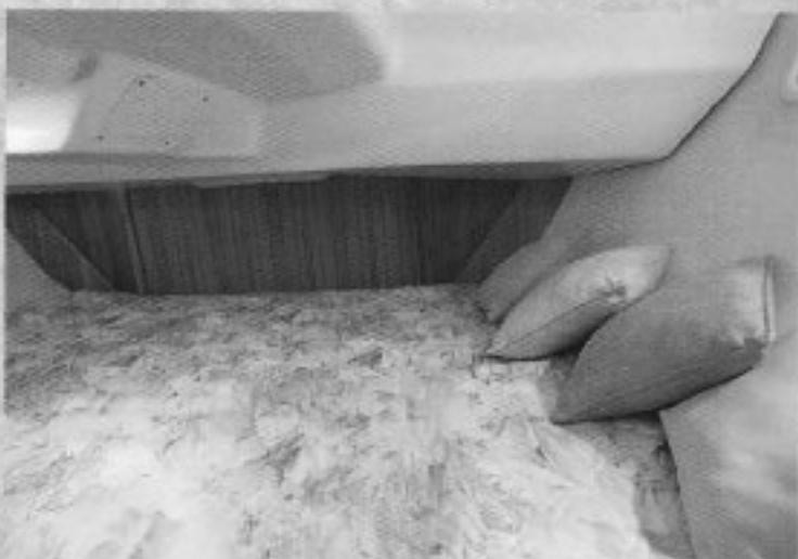
The aft master berth is wide and comfortable. Plenty of storage and privacy await you.