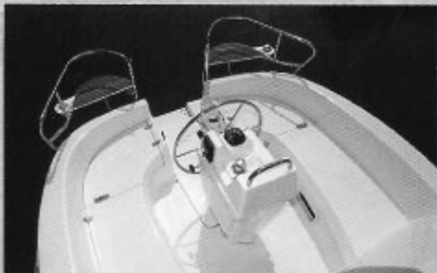
The 290 cockpit is wide and comfortable for sailing and entertaining. It even allows for the standard custom console with drink holders.