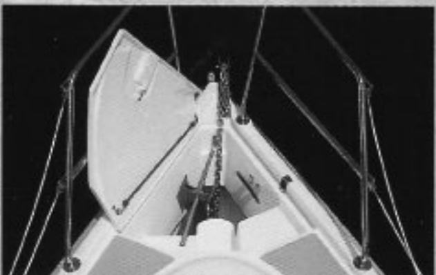
The foredeck anchor well is deep and self-draining, providing for plenty of rode and chain.

While everyone else was complaining about the high cost of marine hardware and accessories, Hunter was doing something about it. The Hunter Cruise Pac ® was developed to make all the accessories and hardware you need standard equipment. We buy top-quality gear in very large quantities. The result? Equally large savings. The Hunter 290 Cruise Pac ® isn't just sails, winches, and running rigging – it's things like an anchor, fire extinguisher, running lights, life jackets – even a copy of US Sailing's Basic Cruising Manual . We invite you to compare the Standard Equipment list below with that of any other manufacturer. You'll discover that Hunter is going the distance for you with more – and better – gear. For less.