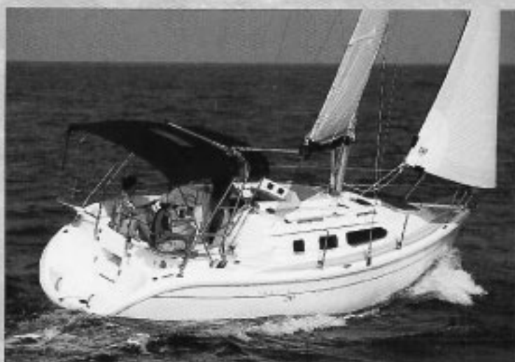
The integrated stainless steel arch functions as an attachment point for the bimini and traveller and it also makes for an excellent handhold while under way.