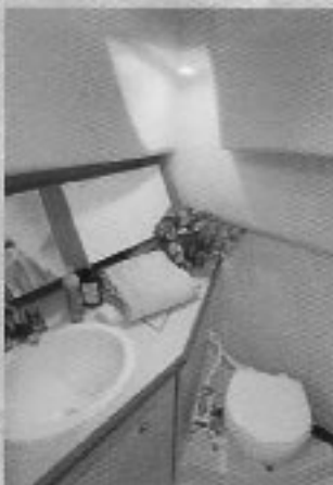
The private head, with shower trimmed in wood accents, provides plenty of storage and is simple to maintain.