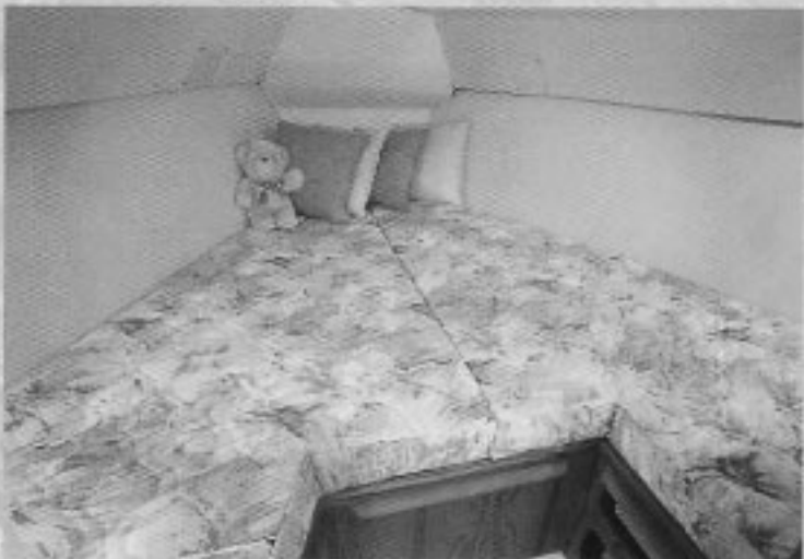
Forward, a private, spacious V-berth will please family and friends. Natural light, good ventilation and convenient storage are abundant.