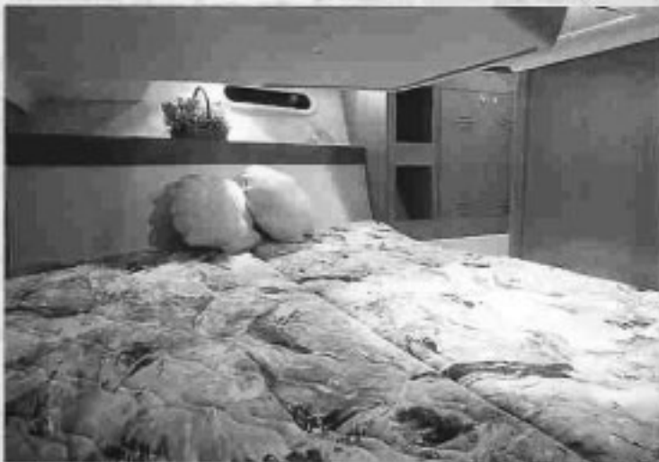
Headroom in the master stateroom is excellent. The queen-size berth is accompanied by two hanging lockers and plenty of storage.

Going forward, you'll see serious non-skid and clear side decks due to the innovative rig arrangement. The B&R fractional rig with its swept-back spreaders eliminates the need for a backstay. Mast struts and reverse diagonals give all the strength needed while