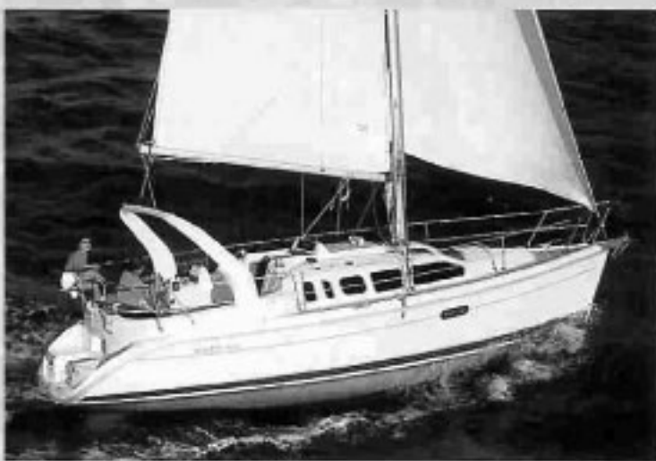
The 310 sports a long waterline giving her superb performance both on and off the wind. A low profile keeps her stable while the boom is high and out of the way.