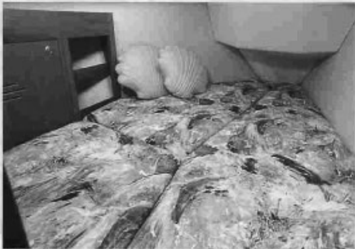
Forward, the guest stateroom is totally private and will hold all the gear your family or friends would need.

If you haven't sailed a Hunter lately, you really owe it to yourself to see what the latest innovations in building production boats can do for you.