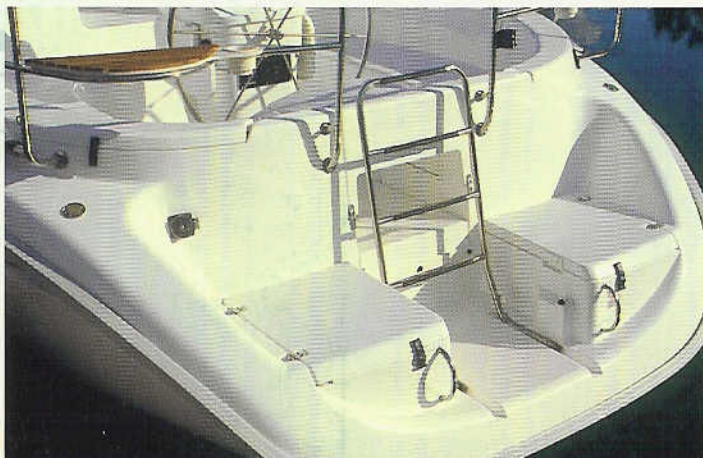
Transom Storage, swim ladder and a hinged, walk through transom make it the most user friendly on the water.

Hunter's innovation continues down below as