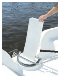
Lift-up VARA rudder system