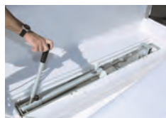
Lift-up VARA rudder system