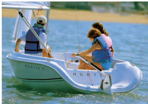
Wide beam for safety and stability