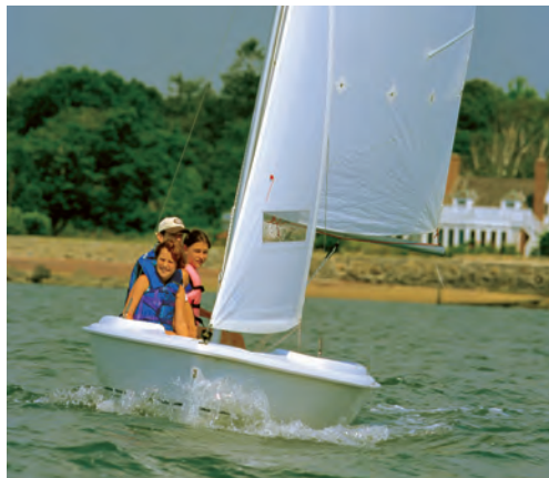
Versatile for the sailing family